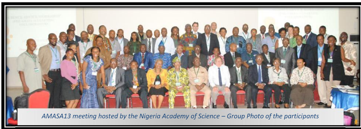
AMASA13 meeting hosted by the Nigeria Academy of Science – Group Photo of the participants

NAS also celebrated its 40 th anniversary as the “ voice of science ” in Nigeria and organized a series of events in commemoration. In addition to hosting the AMASA-13 conference, there was a Learning Collaborative event, facilitated by the International Network for Government Science Advice (INGSA) and focusing on “ the art of providing science advice ”. Nigeria Academy also graciously hosted the LIRA 2030 Annual Research Forum from 14-15 November as a parallel session of the AMASA-13 meeting. The 9 grantees of the 1 st call of the project together with their co-investigators were invited to participate at this forum.