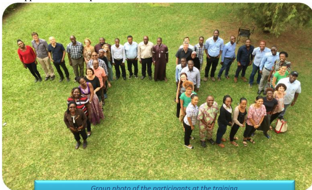
Group photo of the participants at the training

Participants at the training were thereafter given a six-week timeline to submit full proposals. In January 2018, 10 collaborative research projects across Africa will subsequently be awarded the grant each worth up to 90,000 Euro over 2 years.