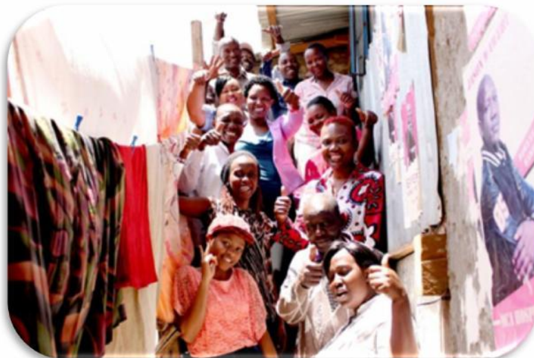
Site visit at Mathare Kosovo

were involved in the project so far. The approach and methodology used in conducting the research was positively unique. They appreciated how actively they had been involved in the research and affirmed that they had a sense of ownership to the project. Those who had participated in the workshop at the University of Nairobi had applauded the experience and their involvement in trying to find possible solutions to their energy needs in the presents of other stakeholders. Most of the members reiterated the fact that they have through the research gained knowledge and enlightenment concerning energy use, effects and availability of sustainable energy sources. Some of the members mentioned how they had been spending so much money on inefficient energies like paraffin and charcoal stoves to cook and heat but have so far realized that using other energies like liquid petroleum gas (LPG) was more efficient and even cheaper. In addition, they were glad that they now had knowledge of the negative effects that comes with using unsustainable energy sources and were now channeling their efforts in changing to better energy forms and creating awareness within the community by enlightening their neighbors and friends.