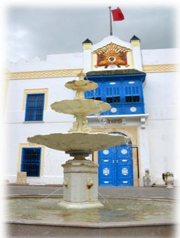
The façade of the Academy palace

The Tunisian Academy Beit al-Hikma was founded in 1992 (Law 116-92 dated 30 November 1992). The Academy took over from the National Foundation for Translation, Establishment of Texts and Studies, which was established in 1983. In 2019, the Academy updated its financial and administrative structure following support from the government through a decree (decree 315 dated 21 March 2019).