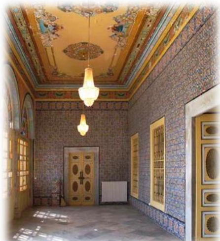
The throne room

The Academy contributes towards the enrichment of the Arabic language, seeing to it that it is correctly used, bringing together and developing its full potential for keeping abreast with sciences and arts. It does this through co-ordination with similar institutions that have the same vocation all over the world. The Academy serves as a meeting-place for distinguished scholars and platform for promoting research in different fields of intellectual and scientific activity as well as exchanging ideas and experience. It also organizes symposiums and conferences in fields that come within its remit, encourages creativity, diffusion and radiation of intellectual and artistic productions.