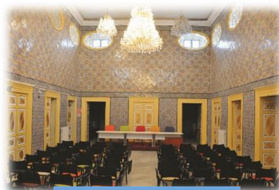
The first floor conference room

As indicated, the National Government of Tunisia provides the academy with financial support. The Academy, however, displays its independence by continuing to be merit based, providing free and independent science-based advice and opinions to the government. The aim of the Academy is to support Tunisian culture in Science, Arts and Literature and to enhance its authority by working on its influence. It gives opinions on important issues sought by the competent controlling authority or any other ministerial department or institution in the country.